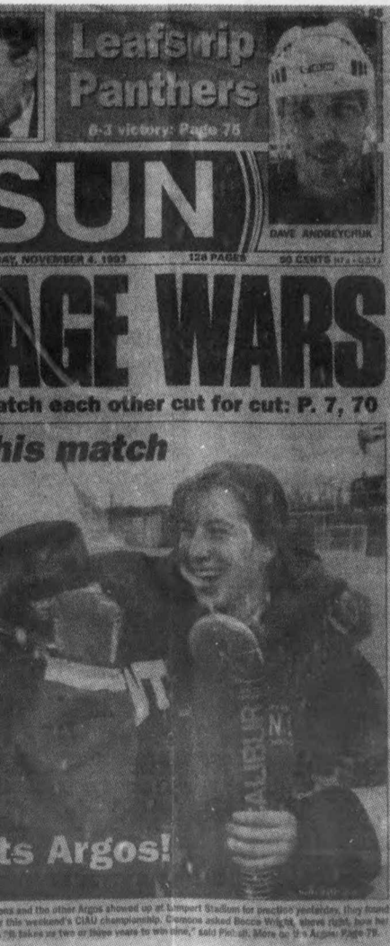
comed the Varsity Reds to the CIAU... posed with Mike 'Pinball' Clemons... into Sun.