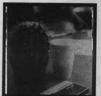
Cactus Bruns II "By smoking doze spiked cigarettes in the SUB"