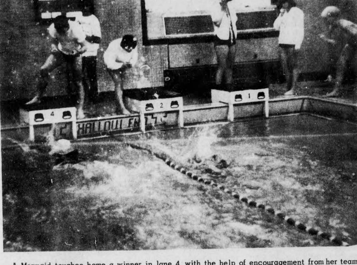
A Mermaid touches home a winner in lane 4, with the help of encouragement from her teammate on the pool deck.

1. Likely - UNB - 48.0 Trask - Bangor - 50.5