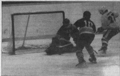
The Bears split a pair with the Saskatchewan Huskies in Saskatoon.

The second game was a tight defensive struggle until the 15:30