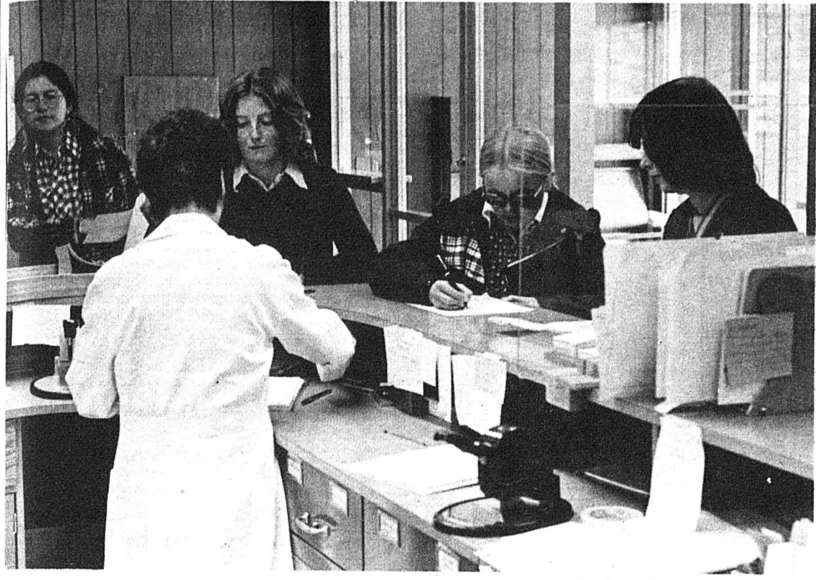
Student Health: Busy as usual