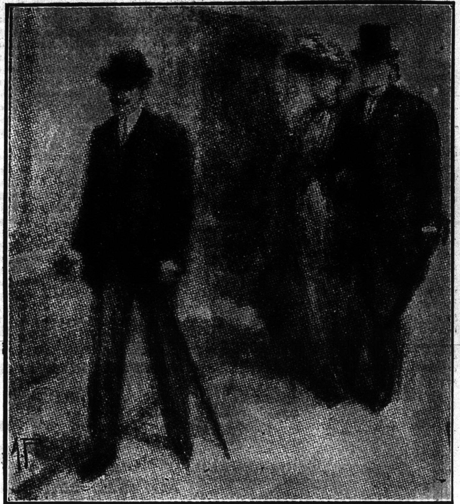
How a short-sighted person out walking sees the passers-by.

sight as an ailment which merely prevents due recognition of distant objects. It is not realized that much more is involved than this. Our limited range of vision gives us not only a circumscribed but also a different view of our surroundings. Thus, in admiring Nature, I, the myopic, behold a landscape other than that which spreads before you. Vegetation, for instance, is blurred and soft like an impressionist picture, the color spreading occasionally as if a child had handled the brush. You see spaces between the clearly-defined leaves of the tree and the light