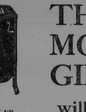
VICTROLA X, $185 Mahogany or Oak

MADE IN CANADA SEaled TIGHT KEPT RIGHT The Flavour Lasts