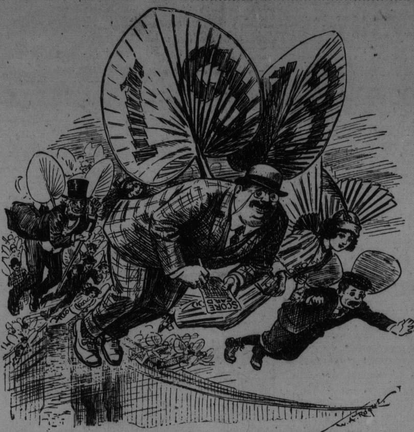
OH, THE FANS. — THE FANS!

Score by innings: Marathons..... 00000000—0 2 0 Calais..... 00002100—3 6 0