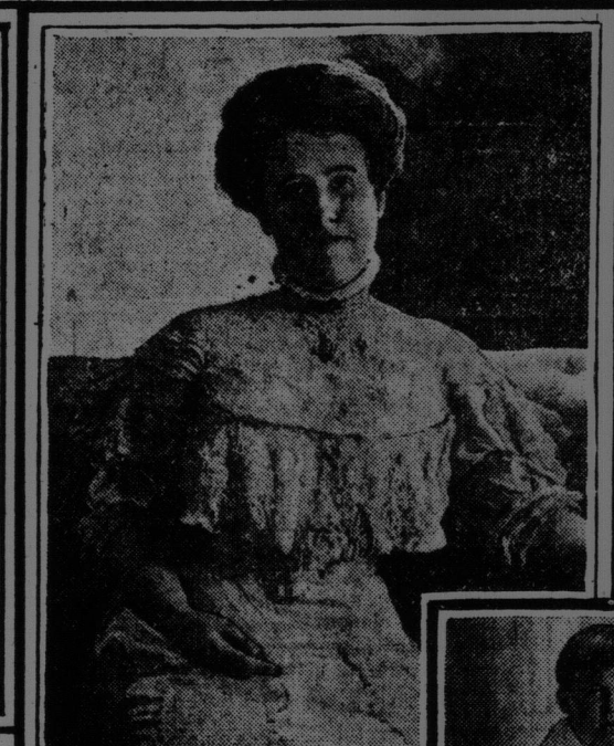
Harry K. Thaw.

Everything now being done in Russia is done in the name of the general good, in the name of the protection and tranquility of the inhabitants of Russia. And if this be so, then it is also done for me, who live in Russia. For me, therefore, exists the desolation of the people deprived of the first most natural right of man—the right to use the land on which he was born; for me the half million men torn away from wholesome peasant life and dressed in uniforms and taught to kill; for me that false, so-called priesthood, whose chief duty it is to pervert and conceal true Christianity; for me all these transpositions of men—from