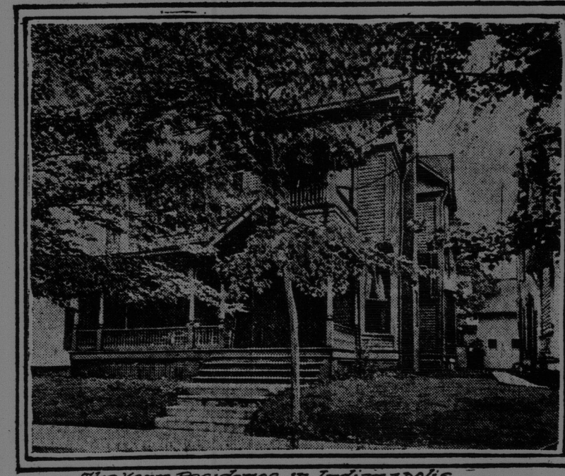
The Residence in Indianapolis.