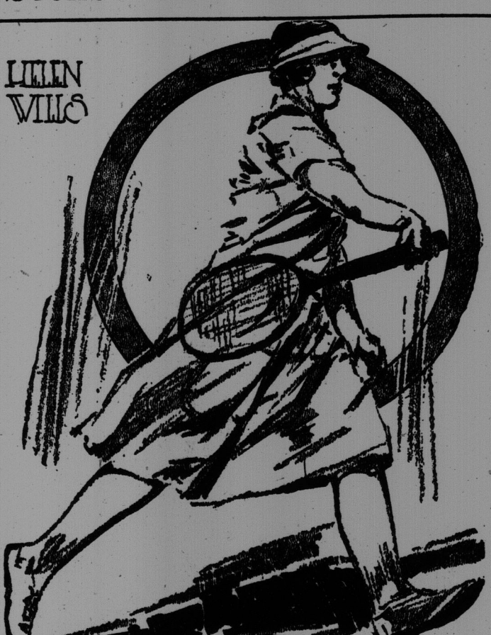
Out on the California courts Miss Helen Wills, national women's tennis champion, is preparing for the coming season.

And according to reports is playing a better game than ever. Helen, as you will doubtless recall, has won the title for the past two campaigns and this year is out to make it three in a row.