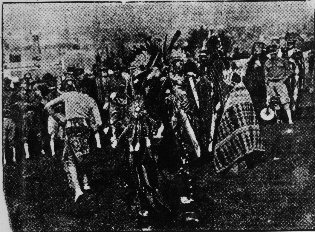
Hoop-la, the Redskins are out for scalp again! But only in athletic contests this time. With thousands of Indians celebrating one of the chief events being a war dance contest—a $250,000 stadium at Haskell Institute, Lawrence, Kansas, now is duly dedicated and is ready for "warfare." This stadium was built by money contributed by Indians in virtually every reservation—among the contributors being two of $15,000 each, from Osages, who have struck it rich in Oklahoma oil.