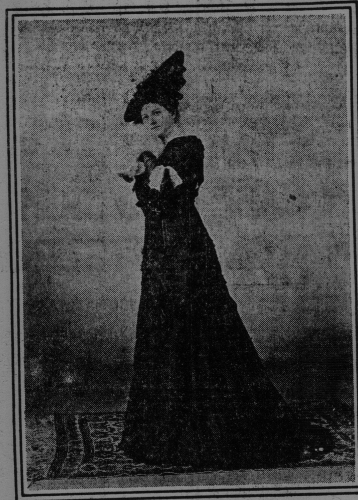
DECIDED EMPIRE LINES.

The most decided and yet the most attractive adaptation of the French Empire gown is seen in the pictured dinner toilette of lustrous black chiffon broadcloth. Panels of embroidered chiton alternating with stitched bands of the cloth form the upper part of the trained skirt, accentuating the height of the figure and giving the