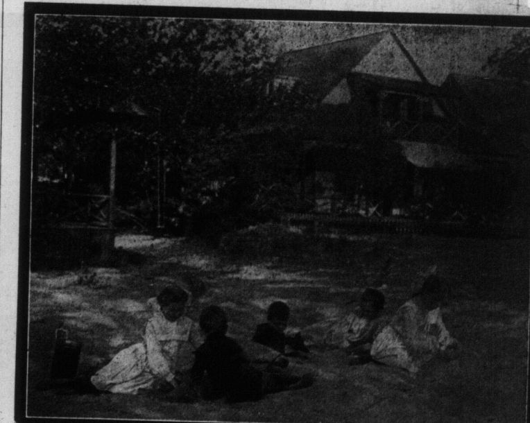
"PLAYING IN THE DEEP, GRAY SAND."