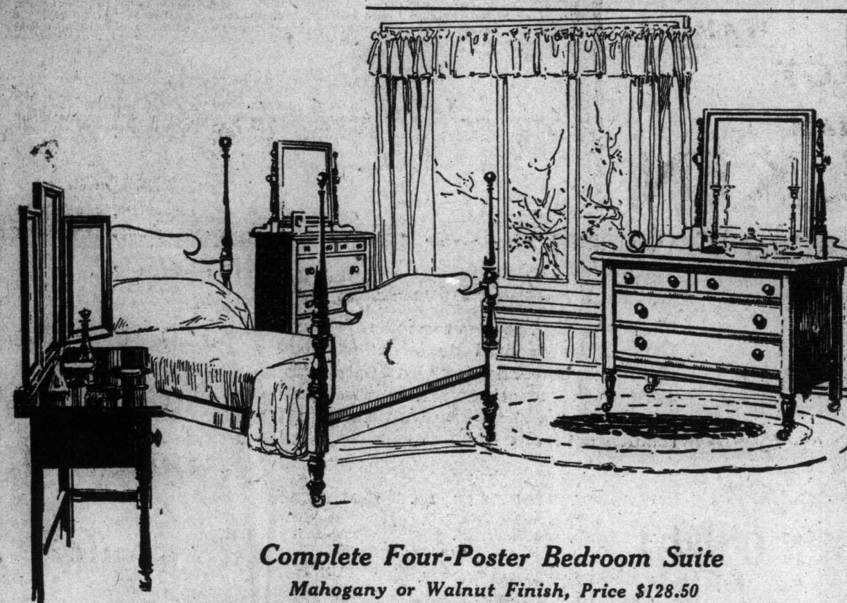
Complete Four-Poster Bedroom Suite Mahogany or Walnut Finish, Price $128.50

Ivory Enamel Dresser, inlaid glass top, 23 x 48, oval mirror 29 x 39. Price, $100.00. Reduced from $160.00.