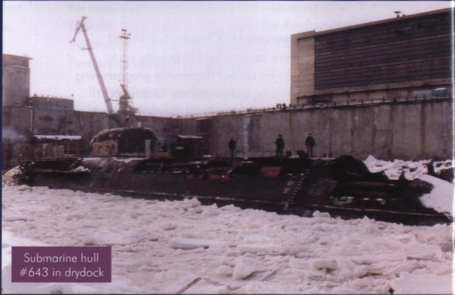
Submarine hull #643 in drydock