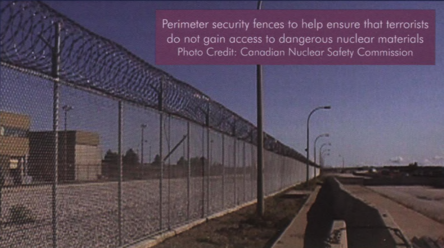
Perimeter security fences to help ensure that terrorists do not gain access to dangerous nuclear materials