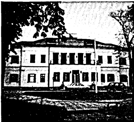
New Canadian Embassy in Hungary.