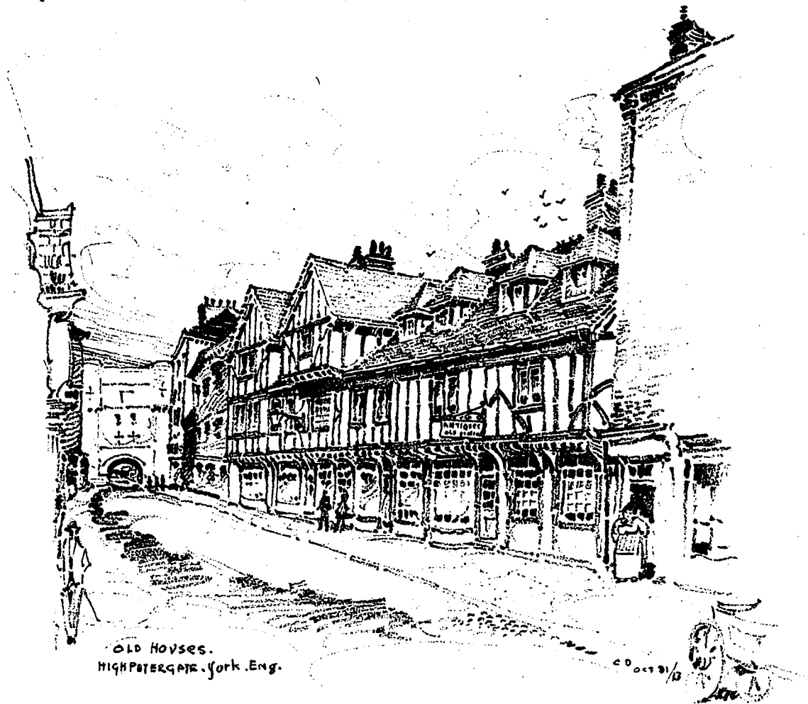
OLD HOUSES, HIGH PETERGATE, YORK, ENGLAND.

Leaving Peterboro I experienced another shock as regards money matters—a railway porter at the station to whom I had given three-pence as a tip for putting my luggage into my compartment, handed me back a penny with the