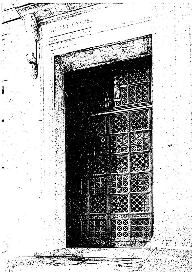
MAIN ENTRANCE, REGISTRY OFFICE, TORONTO.

Main Floor. —The main entrance from Albert street is through a broad lobby and octagonal rotunda from which open entrances to the East and West Registry Divisions and stairs and elevator to the Land Titles section on the second floor. Duplicate offices for the Registry divisions are provided. Each of these consist of a public space, around which are grouped the coat room, waiting room, consultation room, etc., as well as the private offices of the registrar and his secretary. A large receiving space, lighted from above, is provided, with rooms for the comparing of documents, examination of originals with lift to document room on second