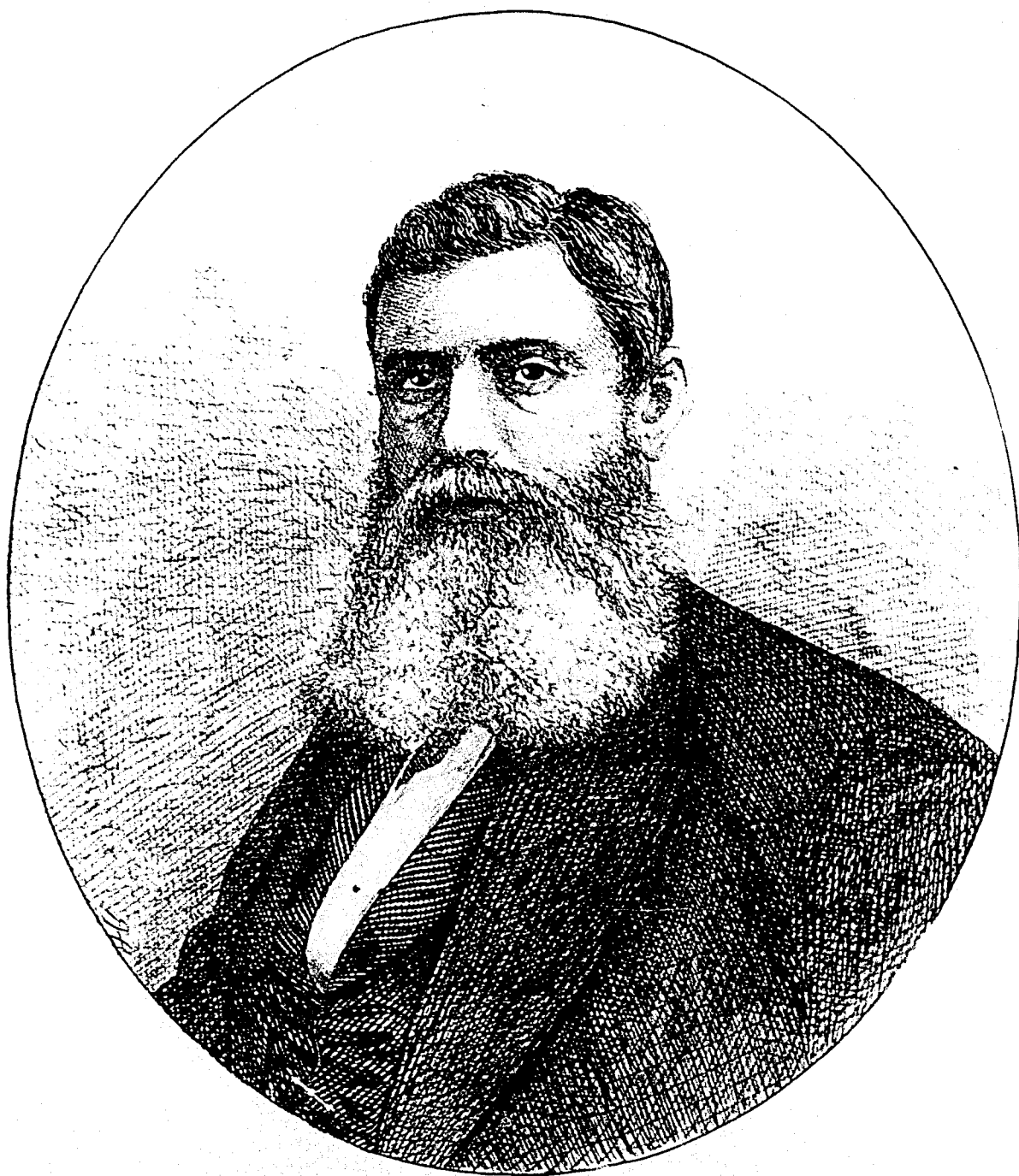
HON. JOHN O'CONNOR, PRESIDENT OF THE PRIVY COUNCIL