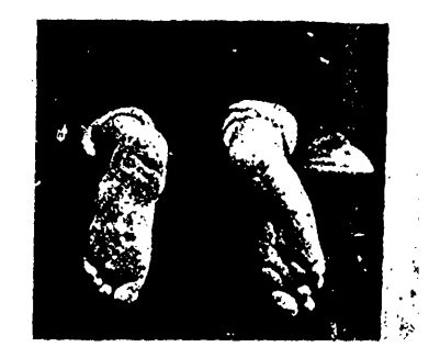
Fig. 1, Case 1.