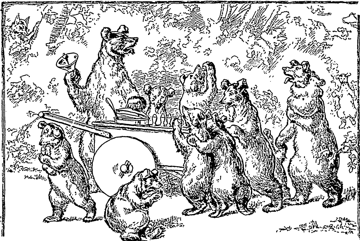
AN ICE CREAM MAN.