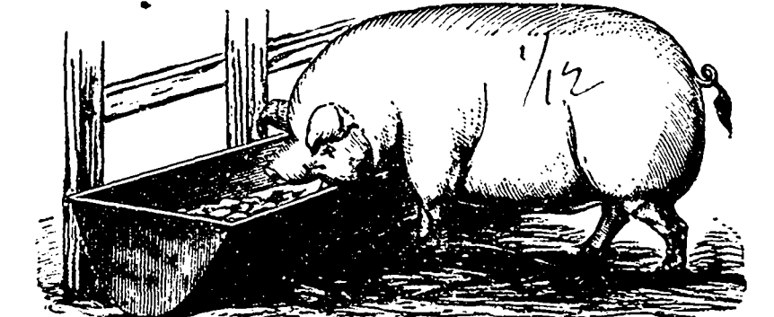
Registered.—Infringement upon any of our Patterns will be rigorously prosecuted.