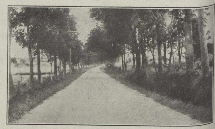
Fig. 3.—Montreal-Quebec Road—St. Paul-l'Ermite (L'Assomption). Macadam Done in 1915.

gravel is recommended. Specifications are never drawn up before the gravel is examined in the laboratory. The engineers also make a study of haulage distances and organization of labor for the benefit of the municipalities.