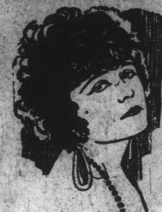
Pola Negri in the Paramount Picture "Men"