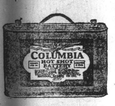
Columbia Hot Shot Batteries con ain 4, 5 or 6 cells, in a neat, water-proof steel case.