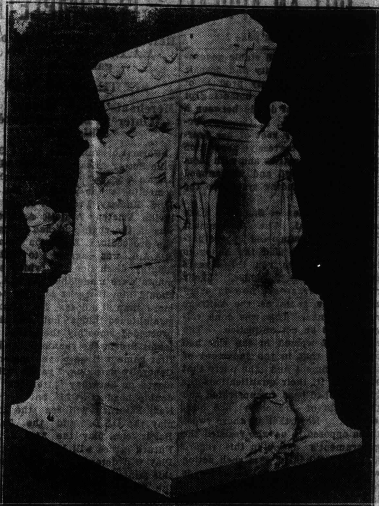
This beautiful monument to the famous Canadian statesman Sir Wilfred Laurier is expected to be erected in Ottawa next summer. The nine provinces of Canada are represented by nine mourning maidens standing around the tomb.