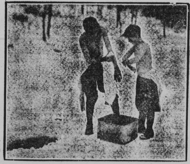
How would you like a morning bath like this, if you had to chop through the ice in zero weather to find water for it, as these boys are doing? Brrr! is right. But they are Boy Scouts.

dangerous list to port while en route here from Vancouver on Thursday, and arrived off Ogden Point with the port rail only a few inches above water, her starboard rail tilted in the air at an angle of 45 degrees. Aboard the ship there was consternation and, ashore, hundreds of persons watched the vessel, momentarily expecting she would turn turtle. It is understood that she had some difficulty in keeping proper ballast in her tanks the heavy load of lumber causing her to list. She was anchored off the breakwater in the afternoon and her crew is working desperately and her crew is working desperately to put her on an even keel. There is talk of towing her to Esquimalt, where some of the cargo could be lifted. The Torhamvan's lumber cargo was for discharge at a Cuban port.