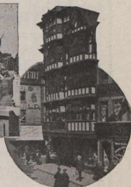
THE OLD DUTCH HOUSE, BRISTOL