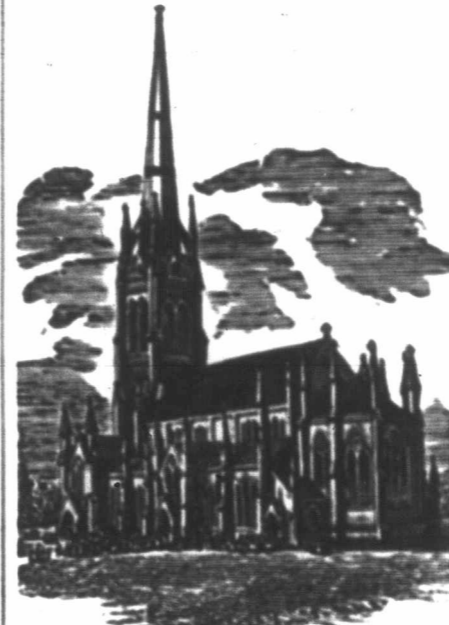
St. James' Cathedral, King St., Toronto, contains 500,000 cubic feet of space and is successfully heated with four of our Economy Heaters.