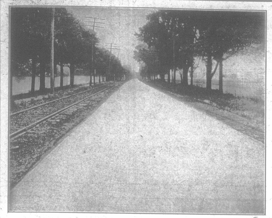
No ruts on this or any other concrete road