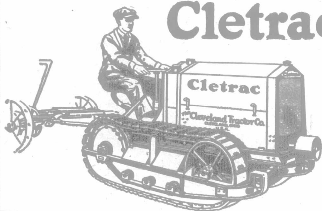
Figure what a difference the Cletrac will make on your place. See it at work. Write for our two interesting booklets "Our Owners Say" and "Selecting Your Tractor."

Low set—will work under trees. Handles easily. Swings in small radius.