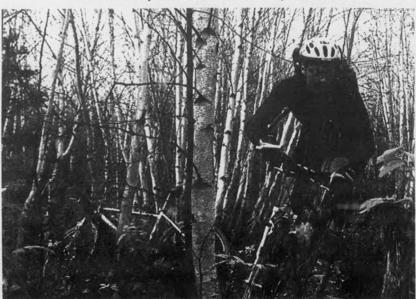
Mike The Friendly Snake Discovered On The Trail

Out On Forestry Field School. Where's My ChainSaw?