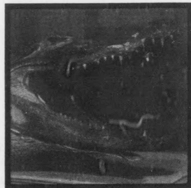
Ollie - CHSR's Mascot

If he's lucky, a free case of Moosehead Green.