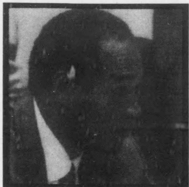
OJ Simpson - Assumed Felon

A pound-o- butter, a box-o-jello and a pair-o-handcuffs.