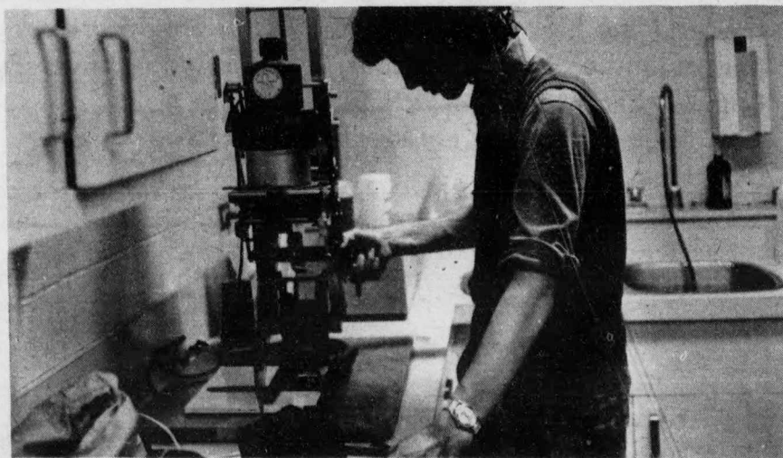
The darkroom is just one of the interesting aspects of life at The Bruns.

Then come the department editors. News takes up the largest portion of the paper, and therefore makes up the largest