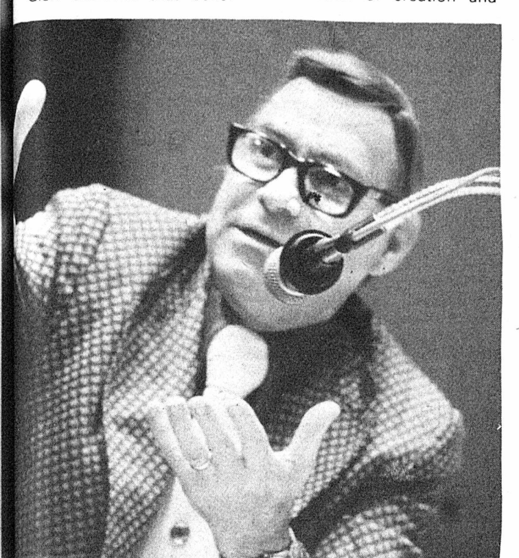
ish whilst expounding.

evolution. "The theory of creation," he said, "is the conviction that this universe could not have generated itself and transported itself from some primordial, dis-ordered state into its present, complex state.