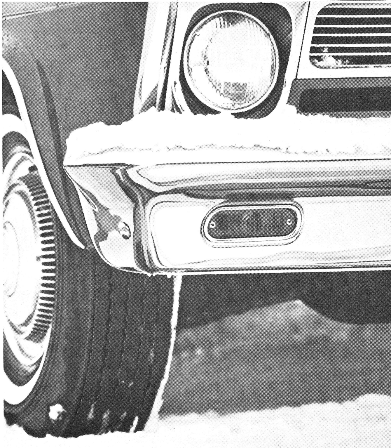
Bumper by Houdaille Industries

"The Bears have won the championship three years running and beaten three of the four eastern teams during that time. They can do it again", he concluded.