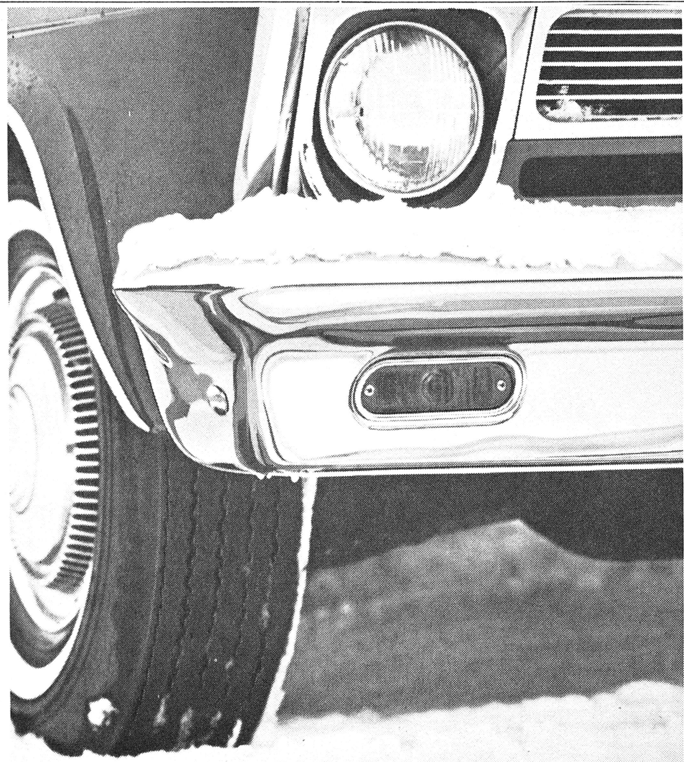
Bumper by Houdaille Industries