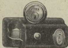
Yale Cylinder Night Latch No. 44, illustrated, is one of the popular members of the Yale Night Latch family. Ideal security. Deadlocking.

Buy your locks and hardware under the trade-mark "Yale"—You'll always see that trade-mark "Yale" on the genuine product. It is never left off.