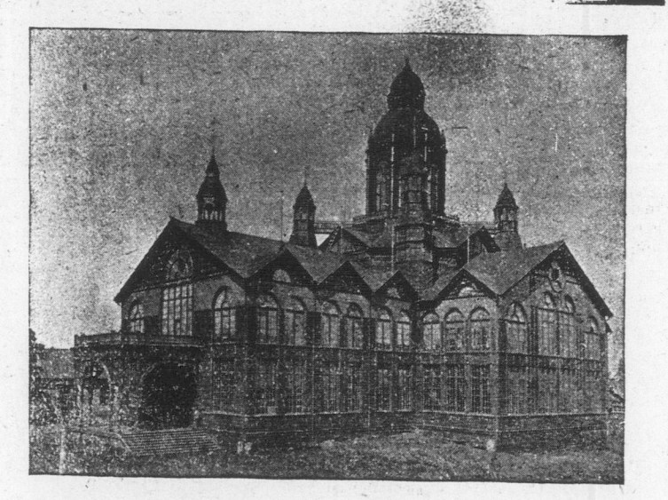
THE EXHIBITION BUILDING.

approval of such a suggestion. They grammes of the three days' races, which contend that if the traps are placed are to commence at 2 p.m. sharp: where proposed the shot will reach the track with sufficient force to injure the petitors. Under these circumstances Race No. 1-Purse, $200; 2.40 class, either a different date will have to be trotting and pacing; three in five. named or the position of the traps alter- Race No. 2-The Flash purse, $150; which are being reserved for the exhibit ed, so that the two events may be held half mile dash. simultaneously with safety.