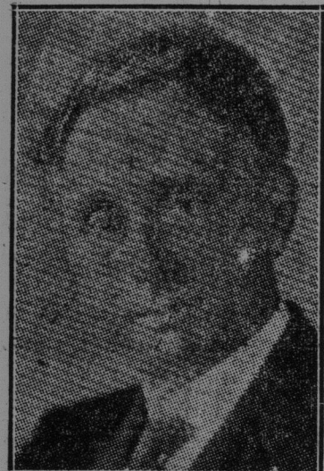
Mr. Justice Brandeis, of the Supreme Court of the United States, who is expected to be one of the delegates from the United States to the peace conference. He is the first Hebrew to attain the supreme court bench.