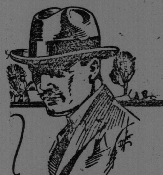
Any time—Any place RAYMOND Hat

Girls Bowling League. The Girls Bowling League match nesday evening on the G. W. V. A.