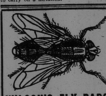
REFUSE UNSATISFACTORY IMITATIONS