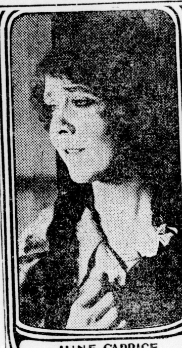
June Caprice in "The Heart of Romance"

The screen's greatest emotional actress, at the Majestic Monday and Tuesday.