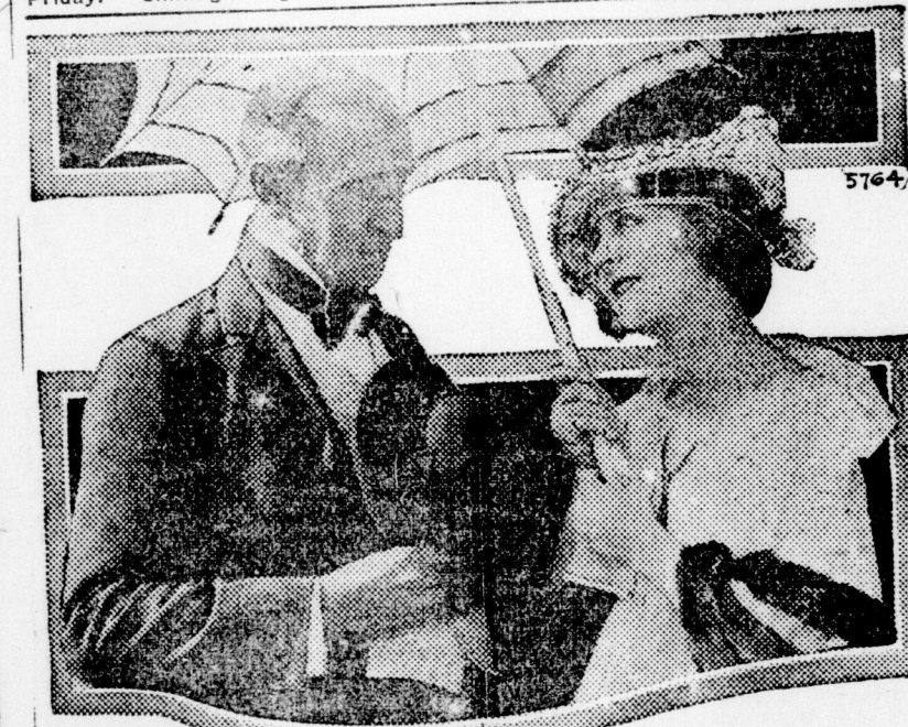
Thomas H. Ince presents ENID BENNETT in "Naughty, Naughty"