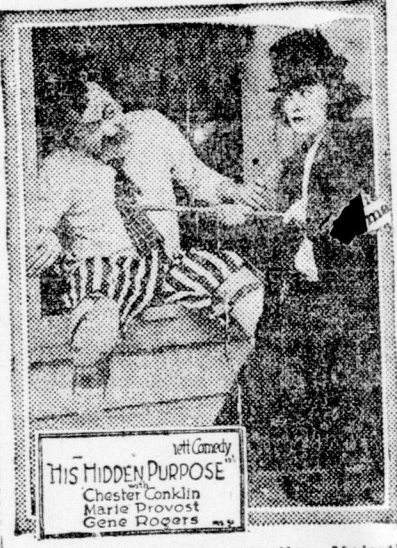
A great comedy at the Majestic Theatre next Thursday, Friday and Saturday.

motorcycle. During the course of the pursuit all three machines plunge into a storm-swollen river. It is so fast that in the middle the cars disappear completely from view. Only the head of a chauffeur appears above the rushing torrent and then after a pause the cars are seen struggling up the opposite bank. This scene was taken during a furious windstorm, which made driving all the more difficult. The boy who drove the touring car was the same one who makes the Bennett cars skid in the comedies until they almost explode a wheel. His skill in this direction is so remarkable that he has been asked by several automobile companies to give special instructions to their drivers in the matter of controlling skidding. "His Hidden Purpose" will be shown at the Majestic Theatre next Wednesday, Thursday and Friday. Enid Bennett, the Pretty Little Australian Beauty, at the Majestic Next Saturday Only in "Naughty, Naughty." The attraction at the Majestic on Saturday of next week is the Paramount picture, "Naughty, Naughty," with Enid Bennett in the leading role. Miss Bennett has for some time been a popular screen favorite, and it is only necessary to say that in "Naughty, Naughty," she has full scope for her splendid talents. A great comedy.