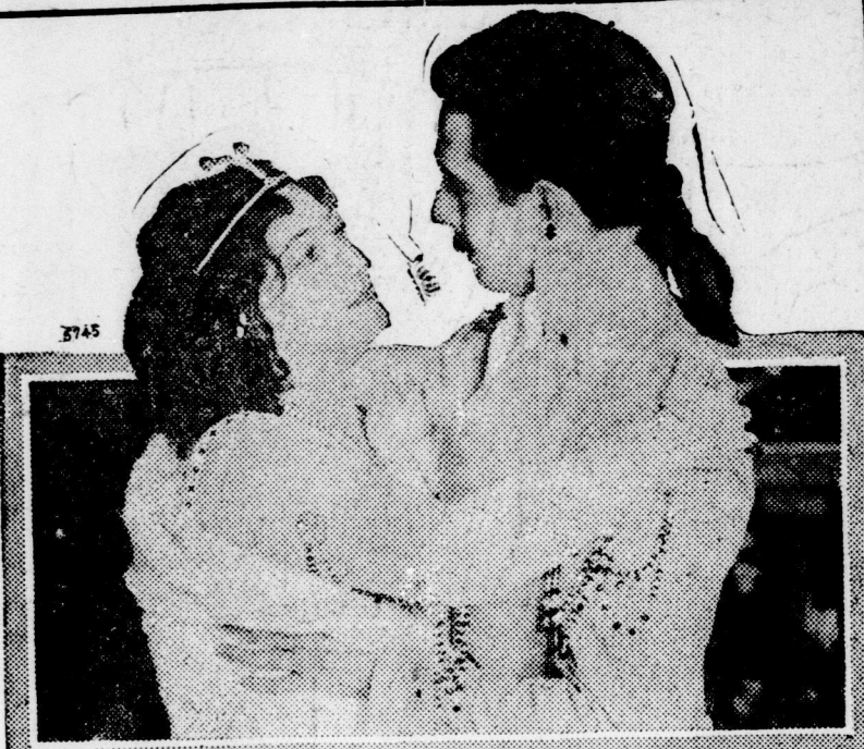
Pauline Frederick in "La Tosca"

Geraldine Farrar in "The Woman God Forgot." When the massive sets were built for the production of "Intolerance," it was thought the last word in the construction of photo-dramatic sets had been reached, but Cecil B. deMille, the famous producer, who is responsible for the Artcraft production, "The Woman God Forgot," in which Geraldine Farrar will be seen at the Unique on Wednesday and Thursday, has gone even further. The scenes of "The Woman God Forgot" are laid during the Spanish conquest of the Aztecs, and Mr. deMille had erected an exact reproduction of