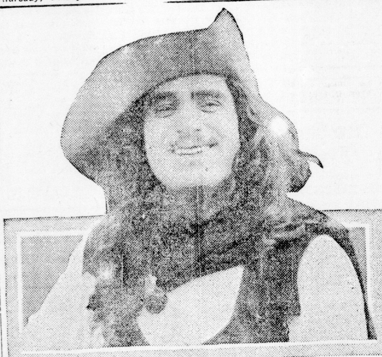
DOUGLAS FAIRBANKS in "A Modern Musketeer"

Pauline Frederick in the Great Photoplay, "La Tosca," at the Majestic Monday and Tuesday. Pauline Frederick, who is appearing