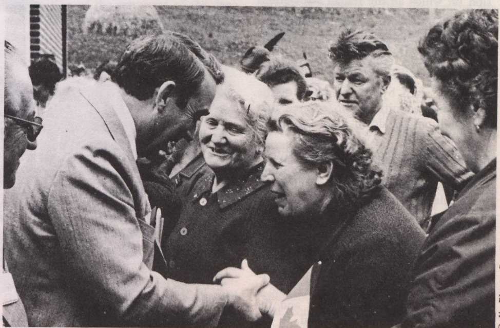
In Taipana, villagers thank Minister of State for Multiculturalism Norman Cafik.