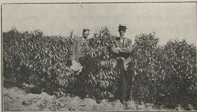
PHOTOGRAPHED IN AUGUST—BLOCK ONE-YEAR PEACH TREES

J. A. SIMMERS SEEDS, BULBS, PLANTS LIMITED TORONTO - - ONTARIO