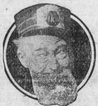
"THE SKIPPER" THE LYCEUM, FRIDAY (To-night)

All types of sharks—mud, sand, hammerhead, white, basking or giant, shark—furnish valuable leather, and the grain of this tough product makes it prized for upholstery, bag and trunk covering, etc. The skin of the average deep-sea shark, which is 10 to 12 ft. in length, measures about 35 sq. ft. This is split as many as eight times.