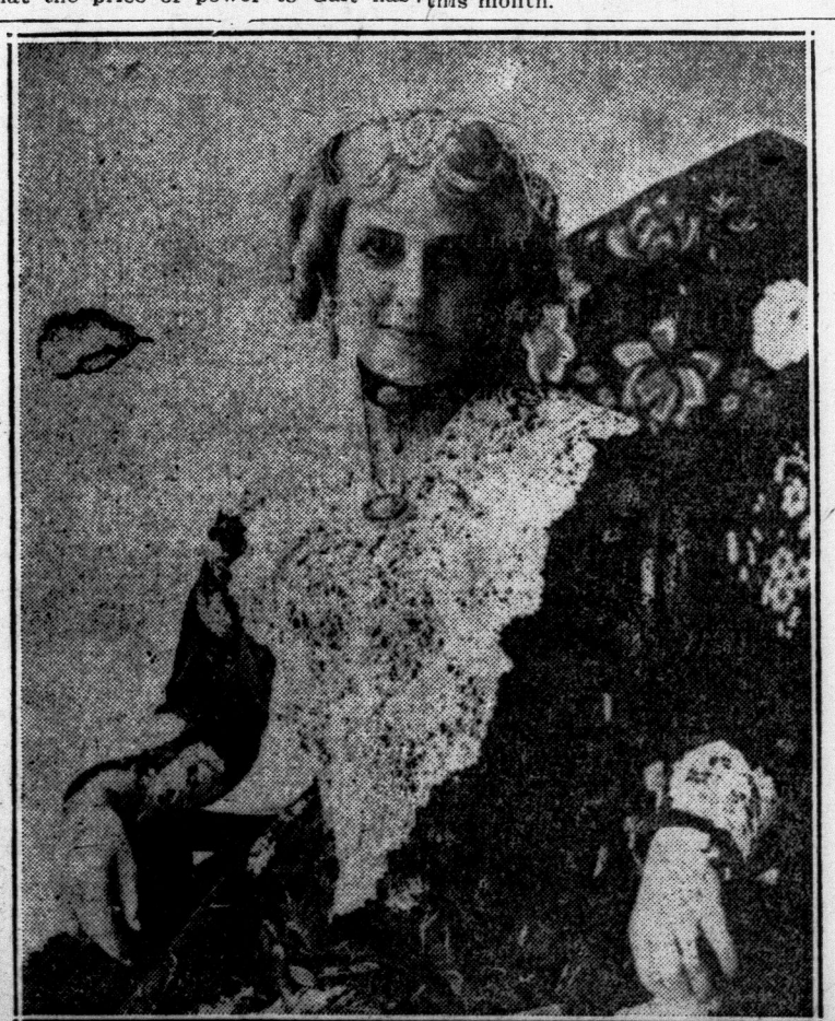
LONDON'S FAVORITE COMEDIENNE.

been advanced from $25 to $28, retroactive to January 1, and authorizing an increase in the rates to the local power users of approximately ten per cent. In making the increase of the cost of power date back to January, the commission will suffer a loss of $7,675.61. The new power rates to the consumer are effective this month.