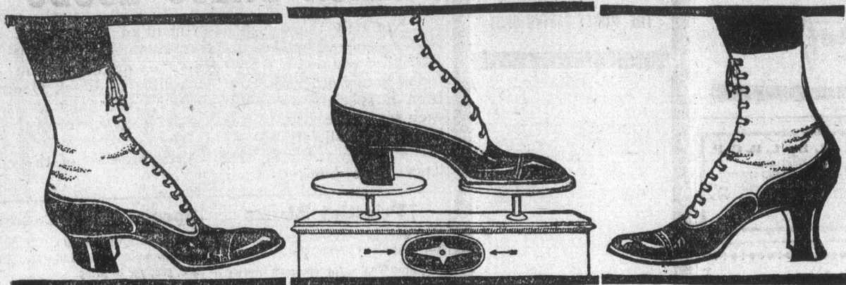
A TOO LOW HEELED SHOE