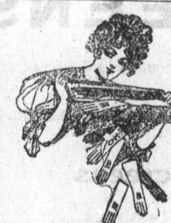
Table Linens and Napkins Fine Damask Towels 25c to 75c Umbrellas for Men and Women 1.00 to 3.00 Silk Waists 1.98 to 6.50 Dress Skirts and Underskirts Gloves and Hosiery Coats and Furs at Clearing Prices

Has been done. There remains a lot to do. For the remaining days there is sure to be a rush. We have so arranged our departments to avoid crowding—be kind enough to take as many small parcels with you as possible—We offer a few suggestions that may be useful in your selection.