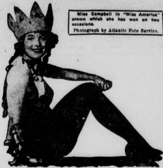
Miss Campbell in "Miss America" crown which she has won on two occasions.

Miss Mary Katherine Campbell, twice proclaimed "Miss America," has taken TANLAC and endorses it in a statement recently given to the women of America through International Proprietaries, Inc., distributors of this great tonic. In this statement, Miss America declares that Good Health is the basis of all Beauty, and advises women who would be beautiful to "first find good health."